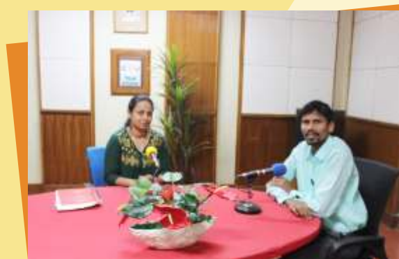
Health talk on All India Radio