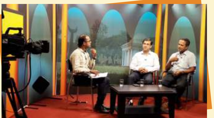
Health talk on Doordarshan